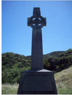
Marsden Cross, Oihi

December 2014 marks the bicentenary of the Revd Samuel Marsden's arrival, along with the first Church Missionary Society families, at Oihi in the Bay of Islands. They were accompanied across the Tasman by Ruatara, Hongi Hika, Korokoro and five other kinsmen. Marsden's sermon on Christmas Day 1814 formally inaugurated the mission in New Zealand.